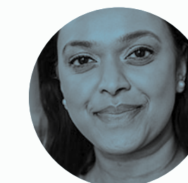
KAMZY GUNARATNAM Deputy Mayor of Oslo, Oslo Municipality