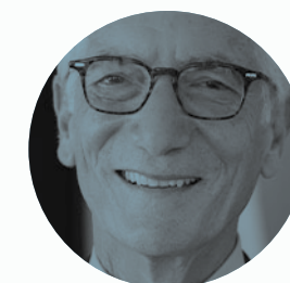
SIR RONALD COHEN Chairman, Global Steering Group for Impact Investment