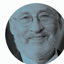
JOSEPH E. STIGLITZ

Director General, Norwegian Agency for Development Cooperation